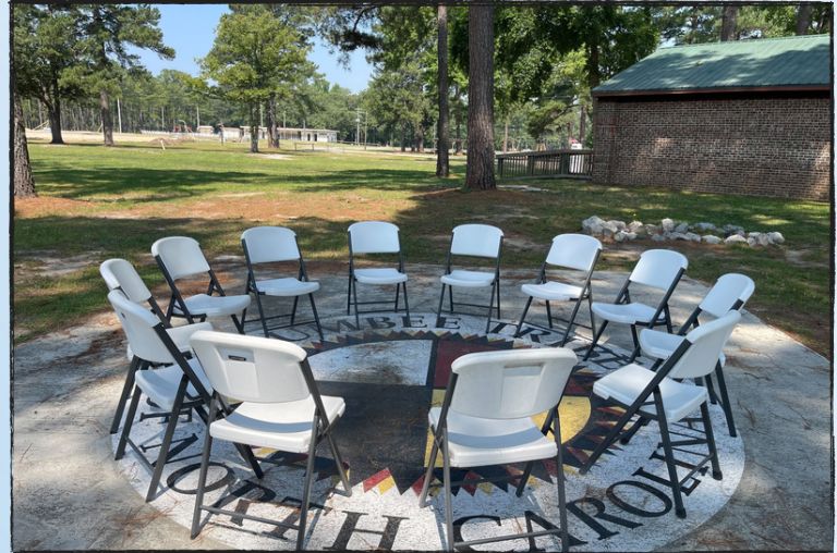
Talking circle around the medicine wheel at the Lumbee Tribal Administration Office in Maxton, NC with community members of the Lumbee tribe.